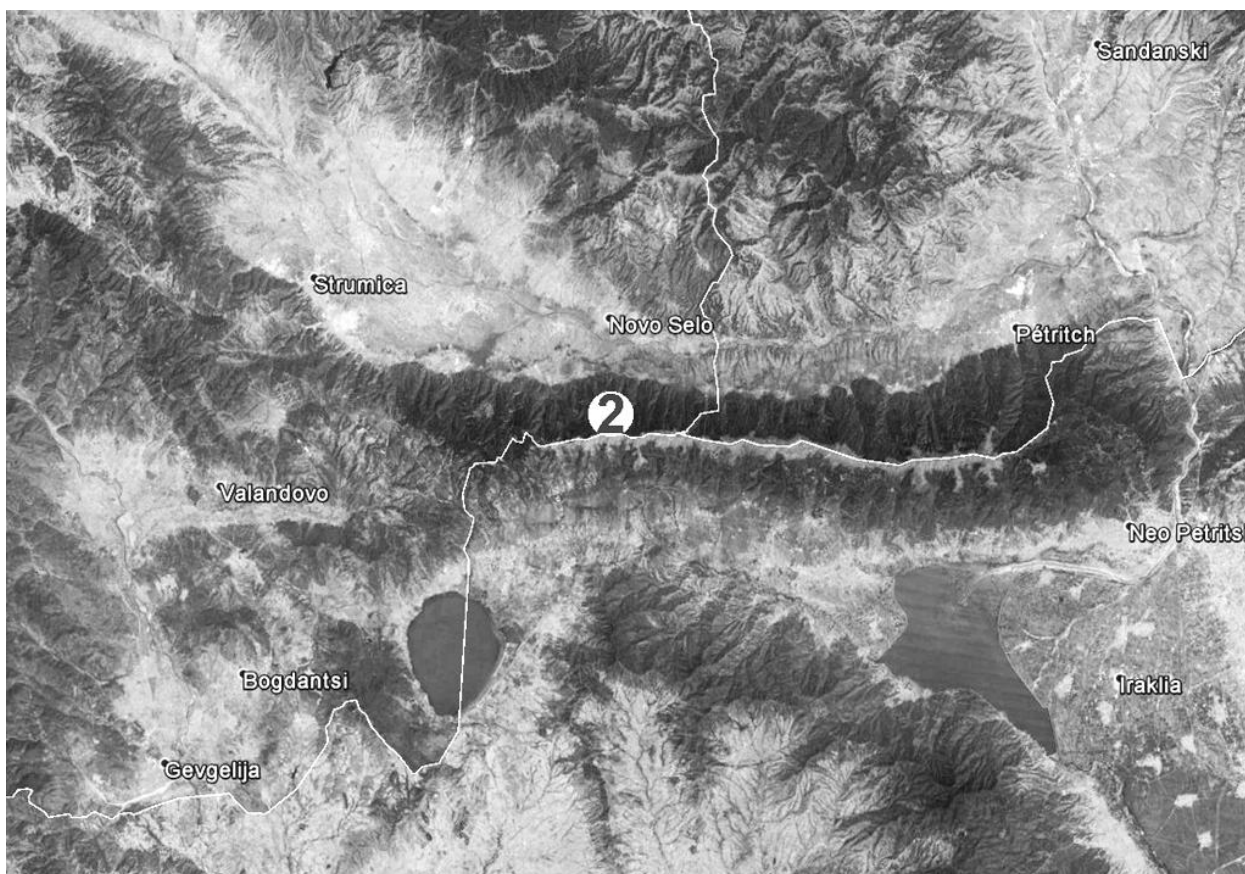
Fig. 3: New locality of Podisma pedestris f. macroptera . Belasica ; Rep. of Macedonia.