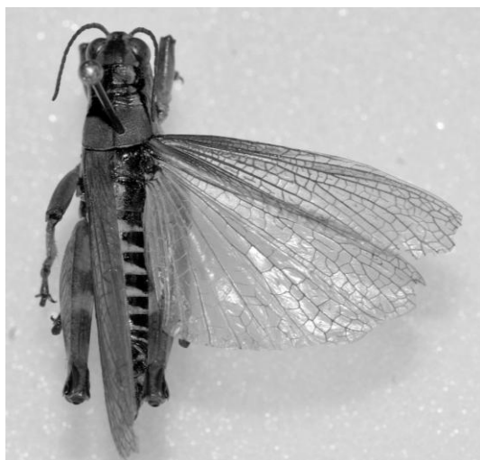
Fig. 4: Podisma pedestris f. macroptera male.