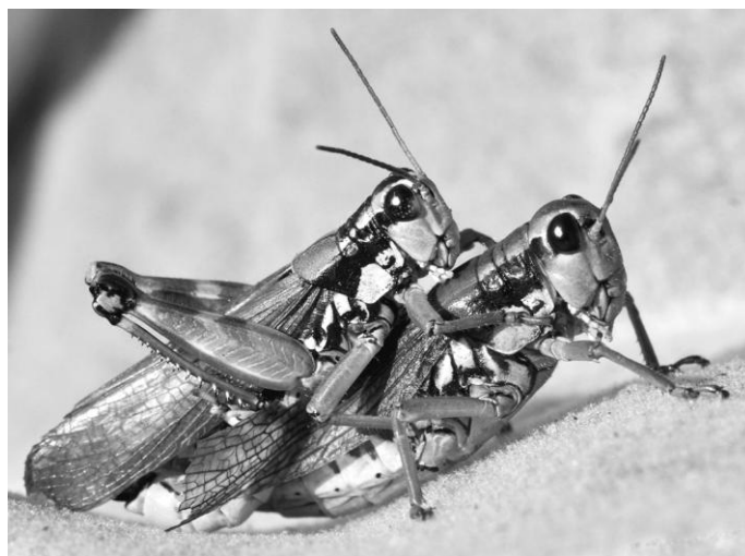
Fig. 5: Podisma pedestris f. macroptera in copula.